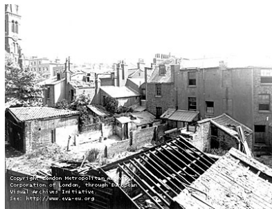
Wartime damage: