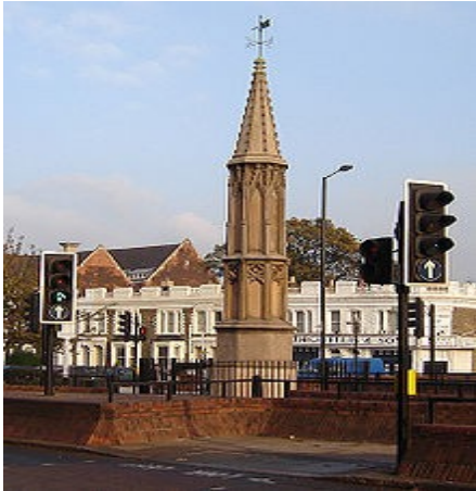
Holy Cross Tottenham