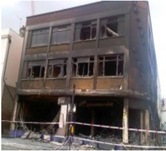
Great Harry Pub Woolwich