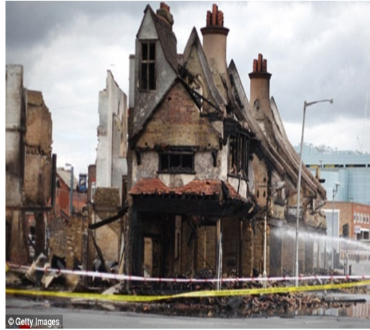
Reeves Building Croydon

In the Sydenham area, the Chair of the Lewisham Ecumenical Borough Deans was out on the streets with members of a Community church and a Street Pastor, who was in uniform, when they were faced with a group of youths who were smashing the windows of the local Cost Cutter store. The Street Pastor spoke with a loud voice of authority commanding them to stop and return home, which, to the group's relief, they did. The Church members then spent the rest of the evening with the employees defending the shop from any further looting and offering practical assistance with transportation home to stranded passengers who were hoping for a bus or train to appear.