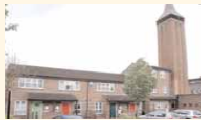
St Georges Close, SW8 (St Georges, Battersea)