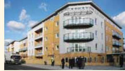
All Saints Court, Poplar (London Borough of Tower Hamlets)