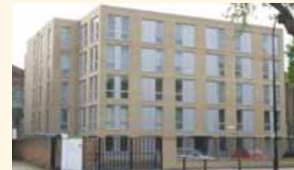
Watling House, SE1 (London Borough of Southwark)