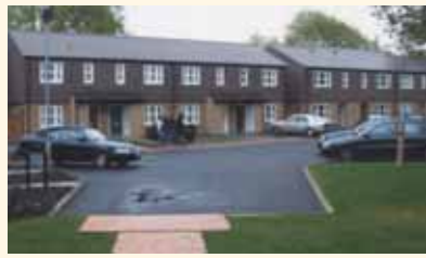
Purkis Close (St Jeromes, Hillingdon)