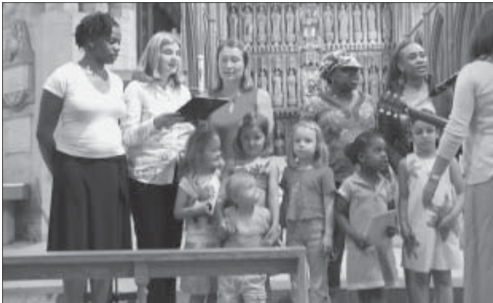
Below: Lambeth WelCare Mums' and Toddlers' Music Group.